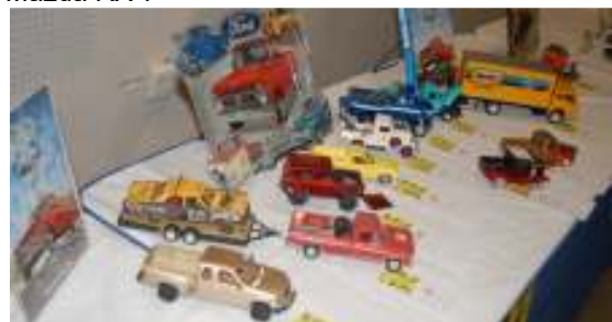
The Theme Award was for 100 Years of Ford Trucks.