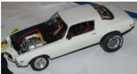
Street Machine class winner