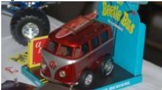
Der Beetle Bus