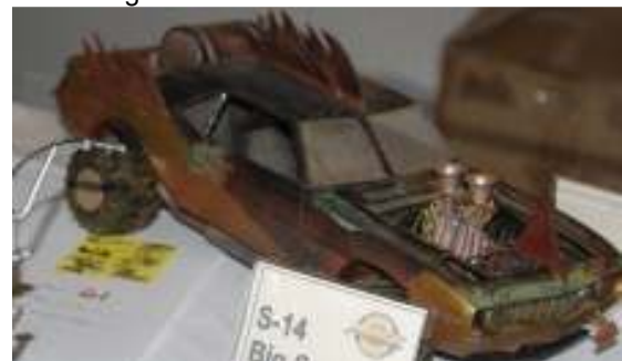
Large scale Road Warrior, class winner