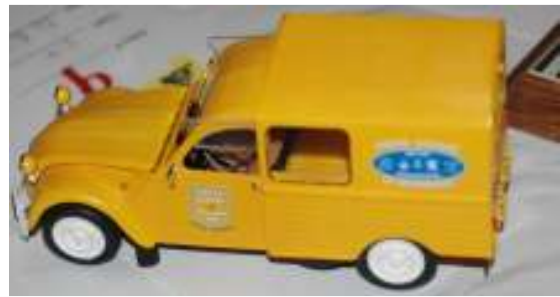
Ebbro Citroen Fourgonnette delivery