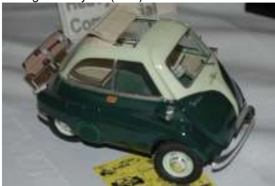
Large scale Revell BMW Isetta