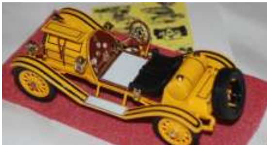
Small Scale Class winner, Pyro Mercer 1/32