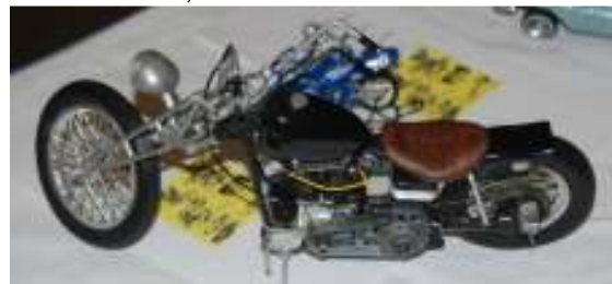
Motorcycle class winner