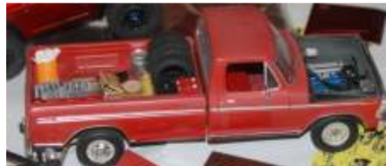
Theme Winner, 100 Years of Ford Trucks