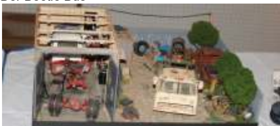
Diorama class winner, also Best Detail