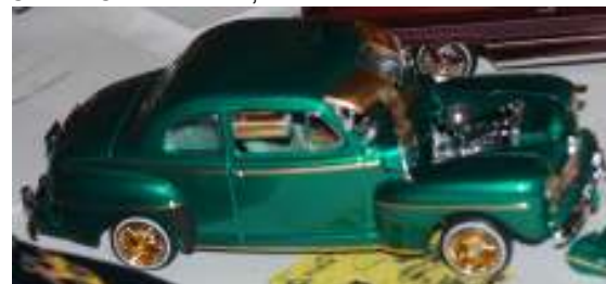
Lowrider class winner, also Best Paint