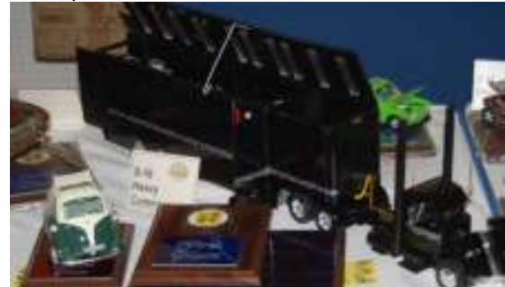
Commercial Winner, also Best of Show, ?Best Detail