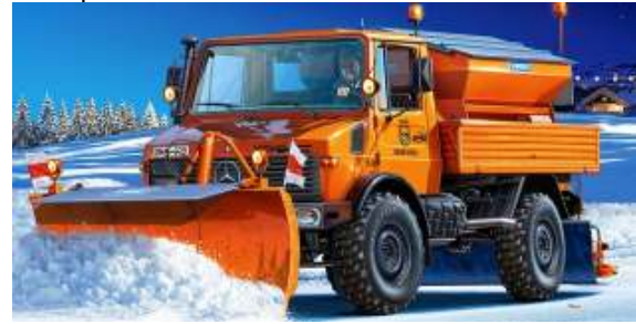
Mercedes-Benz U 1300 L Winterdienst

Revell German has announced a new variant on their 1/24 M-B Unimog kit, this time a winter snow plow.