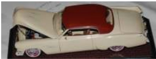
Street Rods class winner