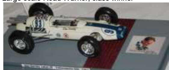
Lotus 29, Dan Gurney 1963 Indy, Open Wheel Competition Class winner