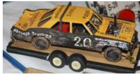
Beat up local short track stocker