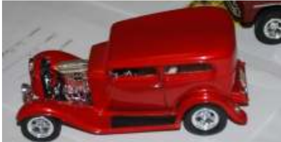
32 Ford Street Rod