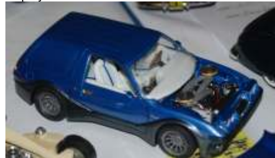
Custom Class winner, a customized Pacer!