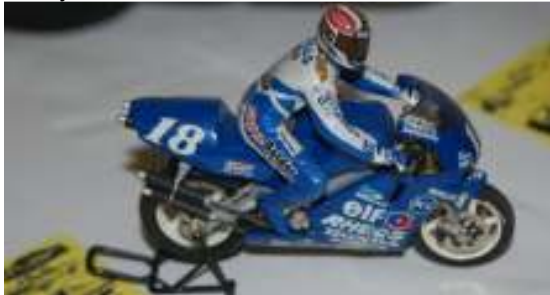
Racing motorcycle (1/24)